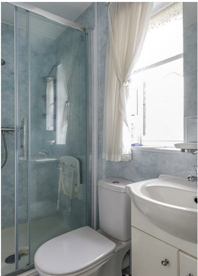
Parc Clwyd, Barry, CF63 1DS